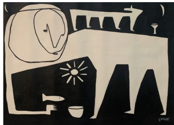
LeCrue Eyebrows, Lastnight's Thoughts , acrylic on canvas, 21 x 28 in