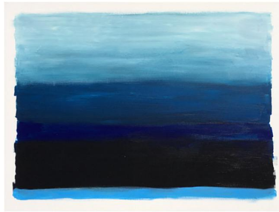
Natalie Winters, Blue Atlantic , acrylic on canvas, 30 x 40 in